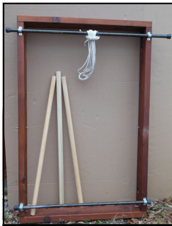
Used Large Cedar Navajo