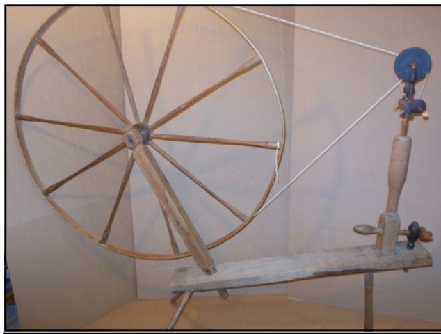
Early 1800's Great Wheel with Miner's Head Contact Hillcreek Fiber Studio $350