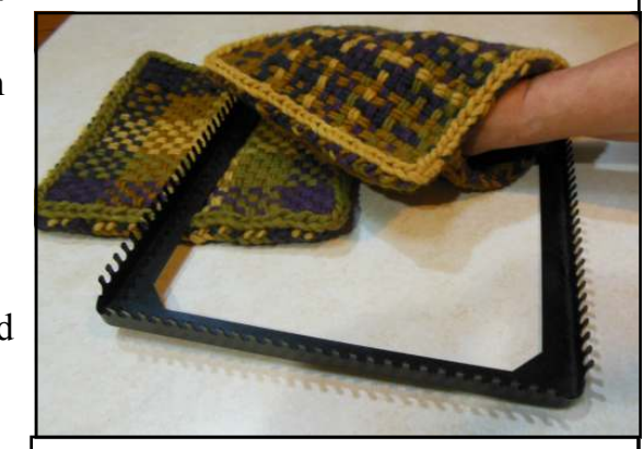
PRO potholder/trivet/oven mitt With PRO Loom

(We also put handles on some for purses.)