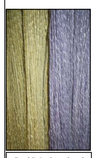
Suri/Merino dyed with Elderberry