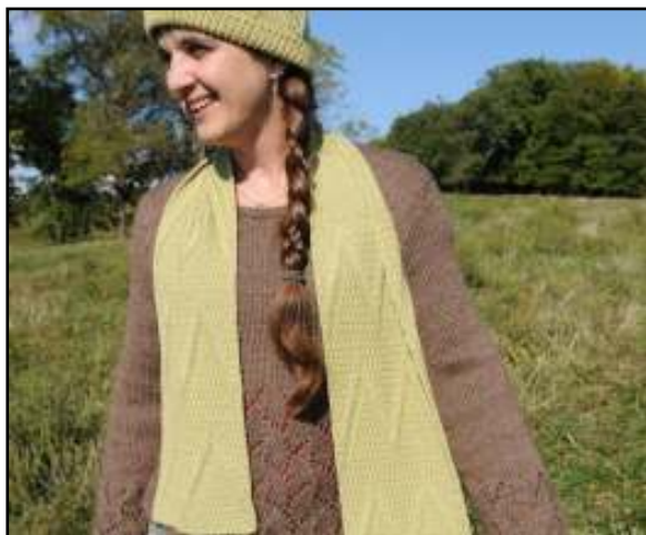
“The Hills are Alive” Hat and Scarf