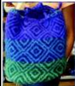
Bex's Olympic Diamond Bag