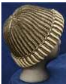
Bex's Two Color Brioche Hat