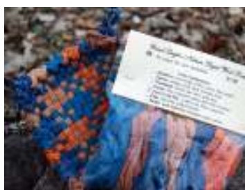
An example of a package of Carol Leigh's Nature-dyed Wool Loops. Terra Cotta Sky shown - $7.50