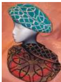
Double Knit Trinity Tam