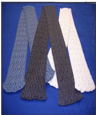
Reversible Cable Scarf