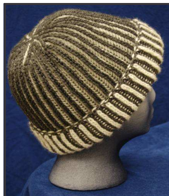
Two-color Brioche Hat